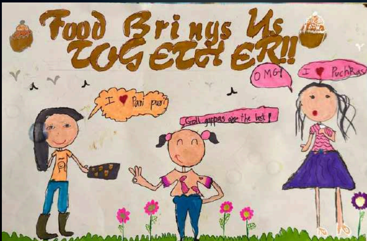
Food brings us together